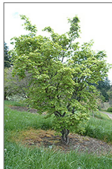
Siebold Maple