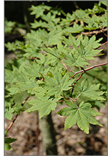
Siebold Maple foliage

This tree does best in full sun to partial shade. It prefers to grow in average to moist conditions, and shouldn't be allowed to dry out. It is not particular as to soil pH, but grows best in rich soils. It is somewhat tolerant of urban pollution. This species is not originally from North America.