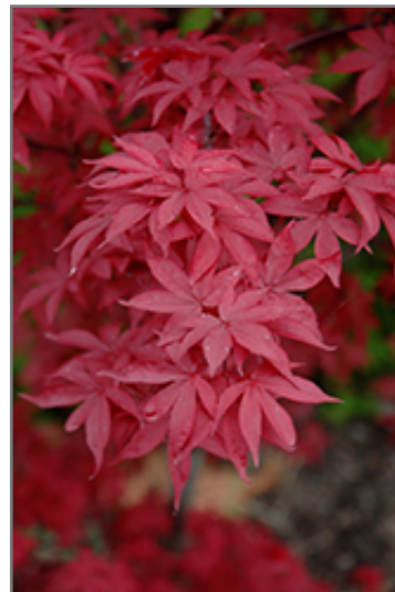
Twombly's Red Sentinel Japanese Maple foliage