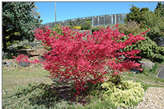
Shindeshojo Japanese Maple in spring

This tree does best in full sun to partial shade. You may want to keep it away from hot, dry locations that receive direct afternoon sun or which get reflected sunlight, such as against the south side of a white wall. It prefers to grow in average to moist conditions, and shouldn't be allowed to dry out. It is not particular as to soil pH, but grows best in rich soils. It is somewhat tolerant of urban pollution, and will benefit from being planted in a relatively sheltered location. Consider applying a thick mulch around the root zone in winter to protect it in exposed locations or colder microclimates. This is a selected variety of a species not originally from North America.