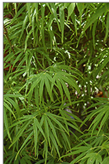
Scolopendrifolium Japanese Maple foliage

Scolopendrifolium Japanese Maple is recommended for the following landscape applications;