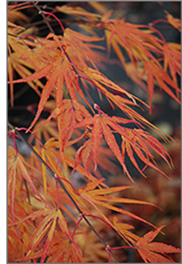
Scolopendrifolium Japanese Maple in fall

Scolopendrifolium Japanese Maple is a fine choice for the yard, but it is also a good selection for planting in outdoor pots and containers. Its large size and upright habit of growth lend it for use as a solitary accent, or in a composition surrounded by smaller plants around the base and those that spill over the edges. It is even sizeable enough that it can be grown alone in a suitable container. Note that when grown in a container, it may not perform exactly as indicated on the tag - this is to be expected. Also note that when growing plants in outdoor containers and baskets, they may require more frequent waterings than they would in the yard or garden.