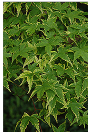
Sagara Nishiki Japanese Maple foliage