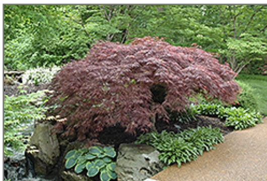
Red Select Japanese Maple