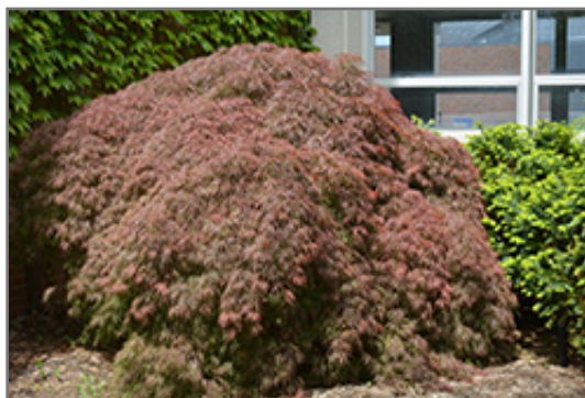
Red Select Japanese Maple