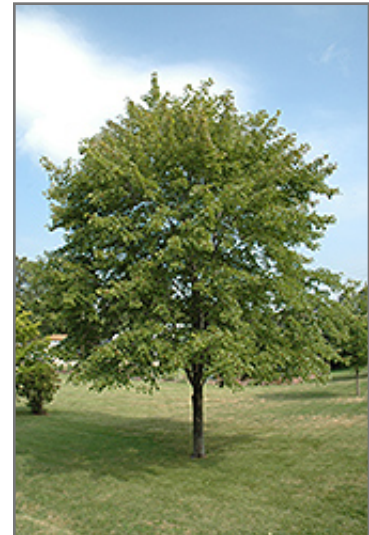
Northfire Red Maple