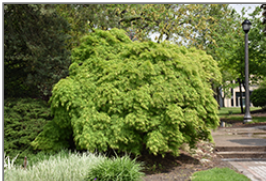
Cutleaf Japanese Maple