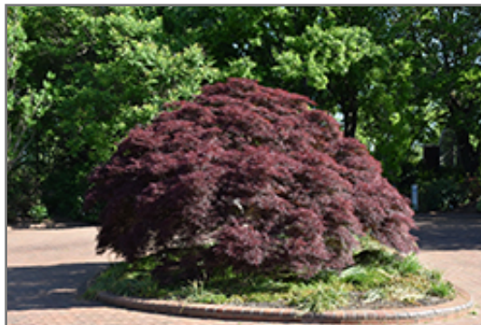
Purple-Leaf Threadleaf Japanese Maple

Purple-Leaf Threadleaf Japanese Maple is recommended for the following landscape applications;