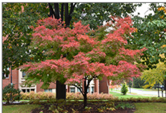
Beni Tsukasa Japanese Maple in fall