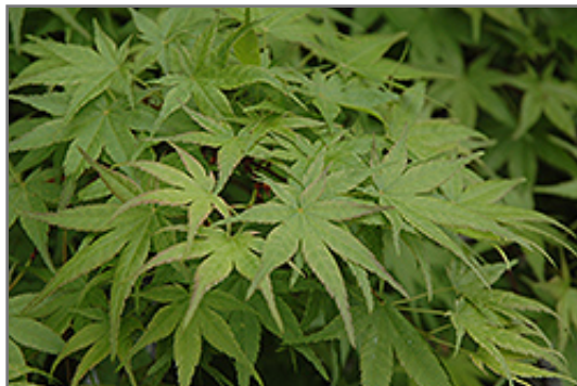
Beni Tsukasa Japanese Maple foliage