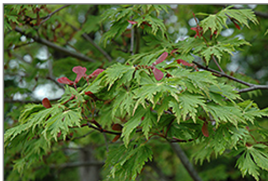
Maiku Jaku Fernleaf Full Moon Maple foliage