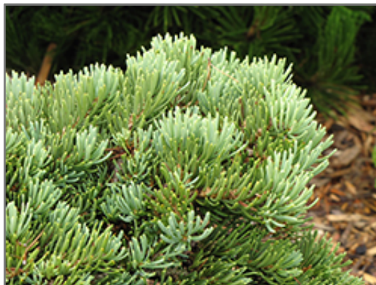
Masonic Broom White Fir foliage