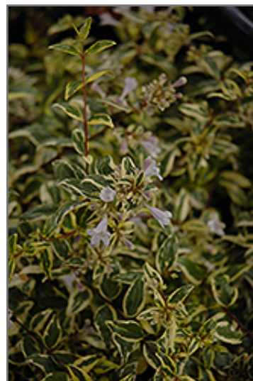
Twist of Lime Glossy Abelia flowers

Twist of Lime Glossy Abelia makes a fine choice for the outdoor landscape, but it is also well-suited for use in outdoor pots and containers. It can be used either as 'filler' or as a 'thriller' in the 'spiller-thriller-filler' container combination, depending on the height and form of the other plants used in the container planting. It is even sizeable enough that it can be grown alone in a suitable container. Note that when grown in a container, it may not perform exactly as indicated on the tag - this is to be expected. Also note that when growing plants in outdoor containers and baskets, they may require more frequent waterings than they would in the yard or garden. Be aware that in our climate, this plant may be too tender to survive the winter if left outdoors in a container. Contact our experts for more information on how to protect it over the winter months.