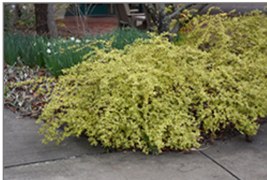
Twist of Lime Glossy Abelia

Twist of Lime Glossy Abelia is recommended for the following landscape applications;