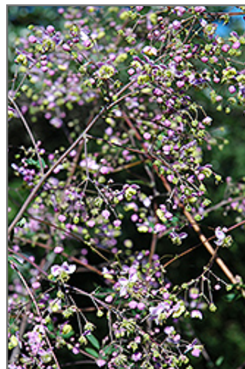
Rochebrun Meadow Rue flowers