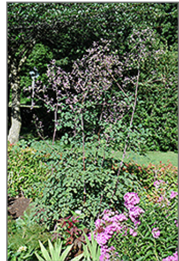
Rochebrun Meadow Rue in bloom