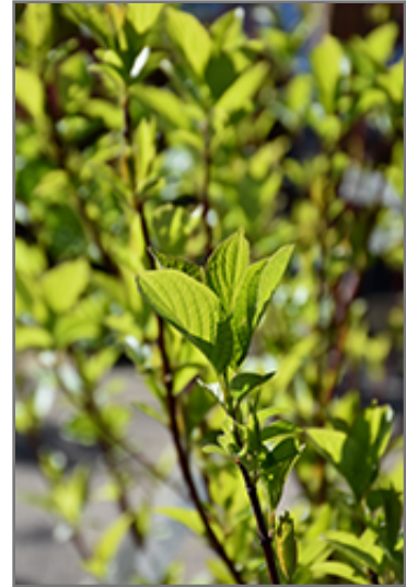
Bailey Red-Twig Dogwood foliage

This shrub does best in full sun to partial shade. It is an amazingly adaptable plant, tolerating both dry conditions and even some standing water. It is not particular as to soil type or pH. It is highly tolerant of urban pollution and will even thrive in inner city environments. This species is native to parts of North America.