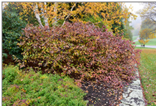
Bailey Red-Twig Dogwood in fall