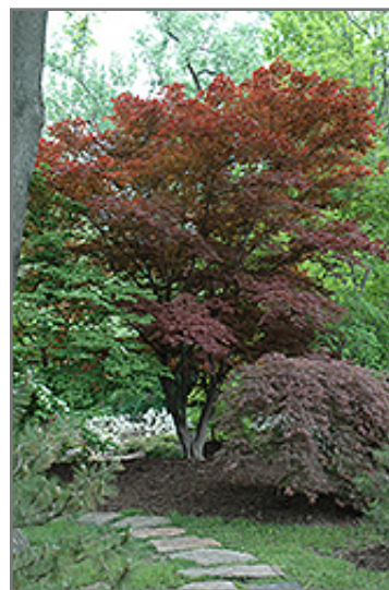
Oshio Beni Japanese Maple