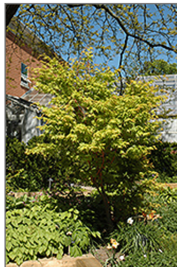
Coral Bark Japanese Maple