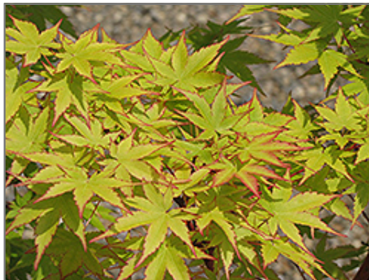
Coral Bark Japanese Maple foliage