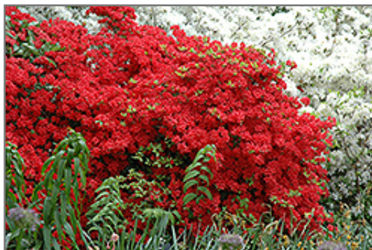
Stewartstonian Azalea in bloom