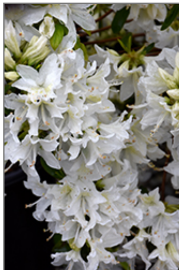
Cascade Azalea flowers