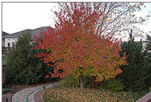
Embers Amur Maple in fall