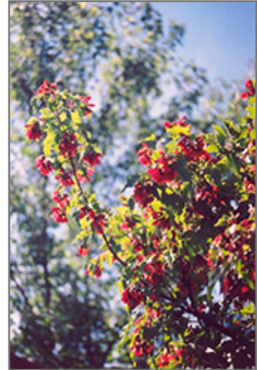
Embers Amur Maple fruit

This tree does best in full sun to partial shade. It is very adaptable to both dry and moist locations, and should do just fine under average home landscape conditions. It is not particular as to soil type or pH. It is highly tolerant of urban pollution and will even thrive in inner city environments. This is a selected variety of a species not originally from North America.