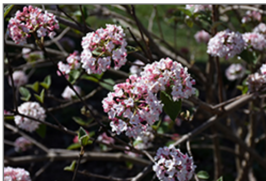
Koreanspice Viburnum flowers