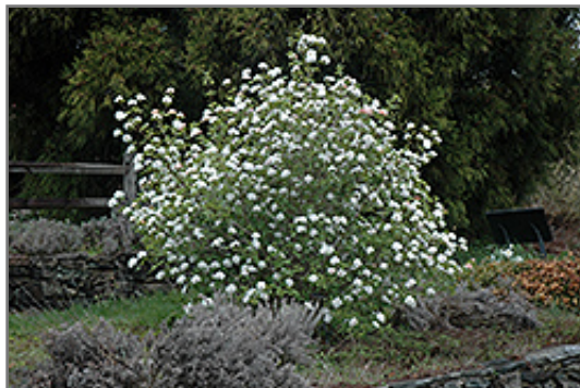
Koreanspice Viburnum in bloom

Koreanspice Viburnum is recommended for the following landscape applications;