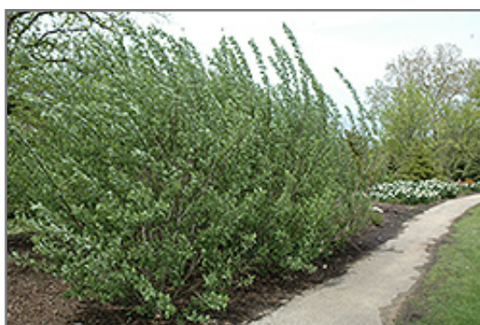
French Pussy Willow