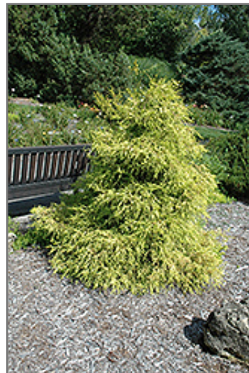
Lemon Thread Falsecypress