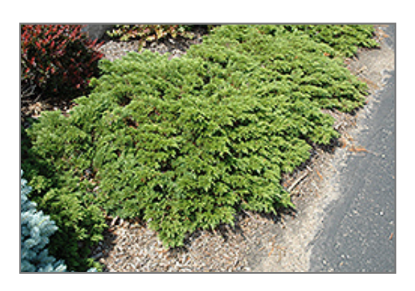
Mini Arcade Juniper

This robust and hardy variety grows lower and spreads farther than the Arcadia juniper; attractive soft green foliage, an excellent choice for poor sites or urban settings; good for foundations or mass plantings