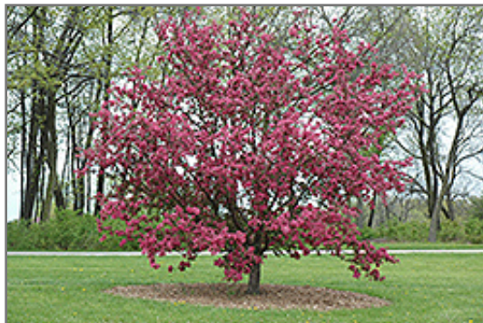
Purple Prince Flowering Crab in bloom