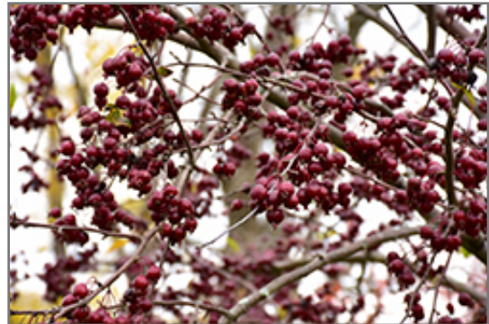
Purple Prince Flowering Crab fruit

This tree should only be grown in full sunlight. It prefers to grow in average to moist conditions, and shouldn't be allowed to dry out. It is not particular as to soil type or pH. It is highly tolerant of urban pollution and will even thrive in inner city environments. This particular variety is an interspecific hybrid.