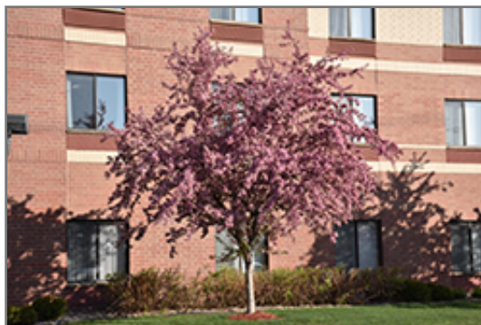
Robinson Flowering Crab in bloom