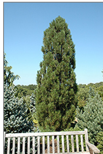
Arnold Sentinel Austrian Pine

Arnold Sentinel Austrian Pine will grow to be about 20 feet tall at maturity, with a spread of 5 feet. It has a low canopy, and is suitable for planting under power lines. It grows at a medium rate, and under ideal conditions can be expected to live for 40 years or more.