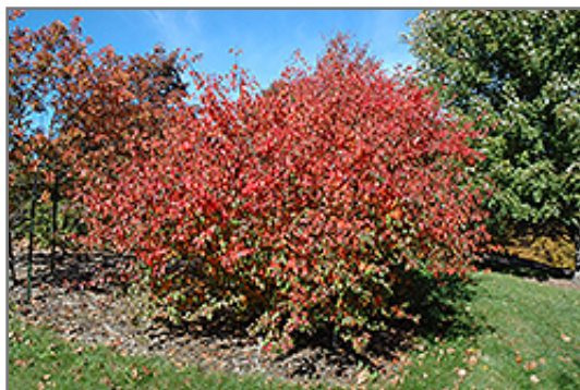
Korean Sun Pear in fall

Korean Sun Pear will grow to be about 15 feet tall at maturity, with a spread of 20 feet. It has a low canopy with a typical clearance of 2 feet from the ground, and is suitable for planting under power lines. It grows at a medium rate, and under ideal conditions can be expected to live for 50 years or more.