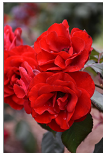
Europeana Rose flowers