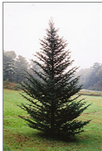
Fraser Fir

Fraser Fir will grow to be about 35 feet tall at maturity, with a spread of 20 feet. It has a low canopy, and should not be planted underneath power lines. It grows at a slow rate, and under ideal conditions can be expected to live for 70 years or more.