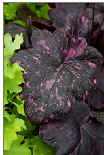
Midnight Rose Coral Bells foliage