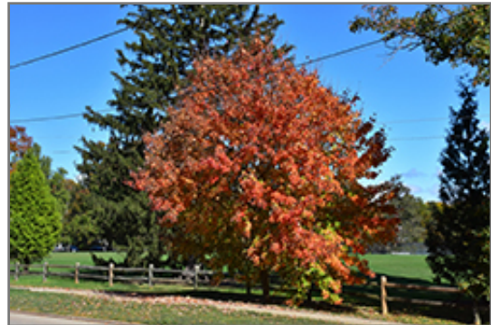
Ruby Frost Red Maple in fall