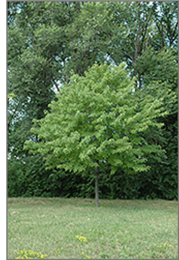
Ruby Frost Red Maple

This tree should only be grown in full sunlight. It is quite adaptable, preferring to grow in average to wet conditions, and will even tolerate some standing water. It is not particular as to soil type, but has a definite preference for acidic soils, and is subject to chlorosis (yellowing) of the foliage in alkaline soils. It is somewhat tolerant of urban pollution. This is a selection of a native North American species.