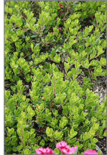
Bearberry foliage

This shrub does best in full sun to partial shade. It is very adaptable to both dry and moist growing conditions, but will not tolerate any standing water. It is considered to be drought-tolerant, and thus makes an ideal choice for a low-water garden or xeriscape application. It is very fussy about its soil conditions and must have sandy, acidic soils to ensure success, and is subject to chlorosis (yellowing) of the foliage in alkaline soils, and is able to handle environmental salt. It is somewhat tolerant of urban pollution. This species is native to parts of North America.