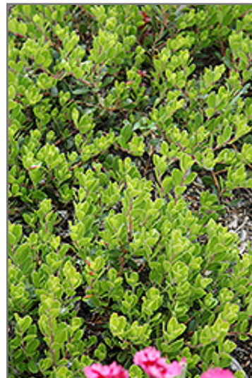
Bearberry foliage

This shrub does best in full sun to partial shade. It is very adaptable to both dry and moist growing conditions, but will not tolerate any standing water. It is considered to be drought-tolerant, and thus makes an ideal choice for a low-water garden or xeriscape application. It is very fussy about its soil conditions and must have sandy, acidic soils to ensure success, and is subject to chlorosis (yellowing) of the foliage in alkaline soils, and is able to handle environmental salt. It is somewhat tolerant of urban pollution. This species is native to parts of North America.