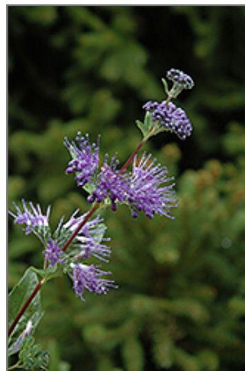
Blue Mist Caryopteris flowers