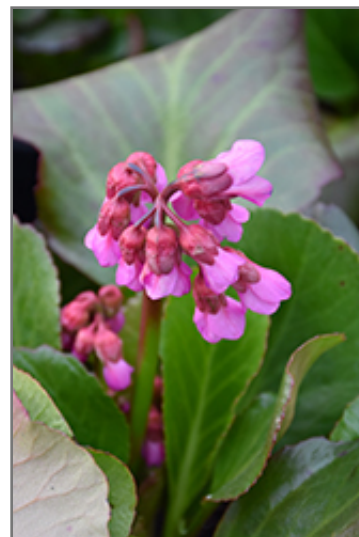
Bressingham Ruby Bergenia flowers