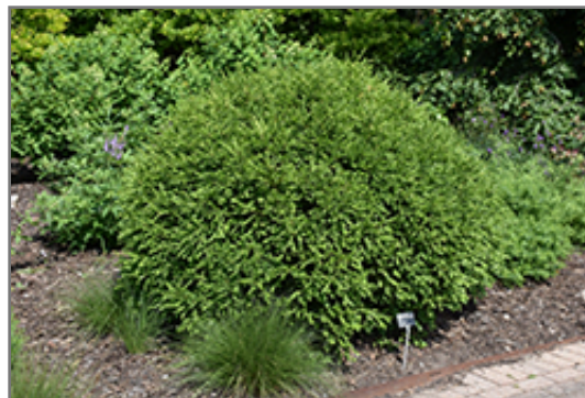
Green Gem Boxwood