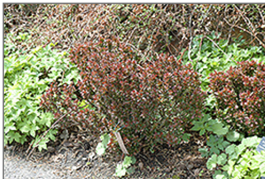
Bagatelle Japanese Barberry