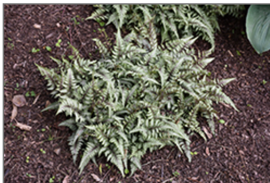
Branford Rambler Fern

Branford Rambler Fern will grow to be about 24 inches tall at maturity, with a spread of 24 inches. Its foliage tends to remain dense right to the ground, not requiring facer plants in front. It grows at a slow rate, and under ideal conditions can be expected to live for approximately 15 years. As an herbaceous perennial, this plant will usually die back to the crown each winter, and will regrow from the base each spring. Be careful not to disturb the crown in late winter when it may not be readily seen!