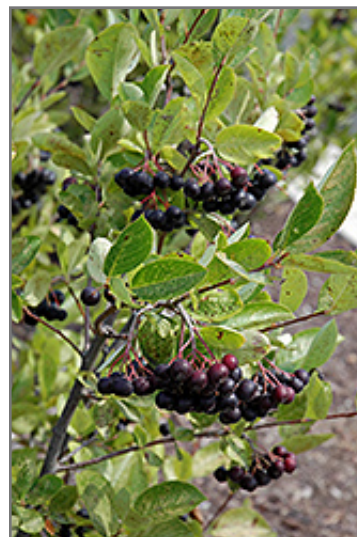
Iroquois Beauty Black Chokeberry fruit