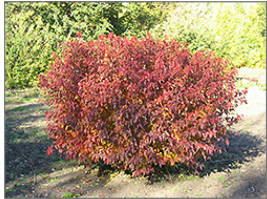
Atomic Amur Maple in fall

This shrub does best in full sun to partial shade. It is very adaptable to both dry and moist locations, and should do just fine under average home landscape conditions. It is not particular as to soil type or pH. It is highly tolerant of urban pollution and will even thrive in inner city environments. This is a selected variety of a species not originally from North America.