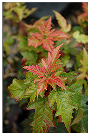
Atomic Amur Maple in fall