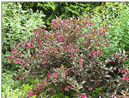
Midnight Wine Weigela in bloom