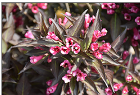
Midnight Wine Weigela flowers