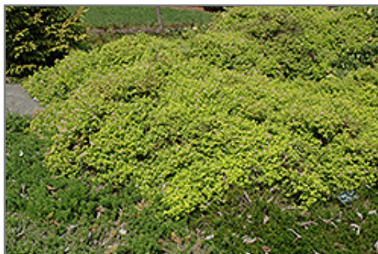
Golden Elf Spirea

Golden Elf Spirea is recommended for the following landscape applications;