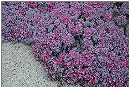
Lidakense Stonecrop in bloom