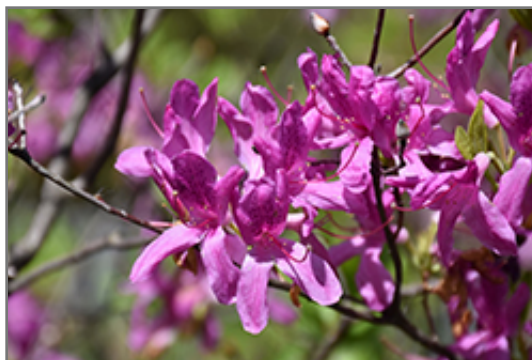
Lilac Lights Azalea flowers