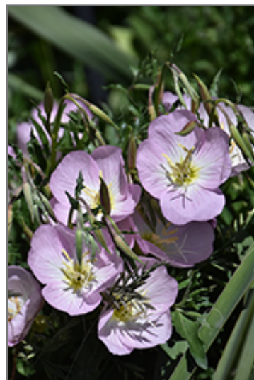
Evening Primrose flowers