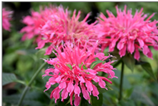
Coral Reef Beebalm flowers