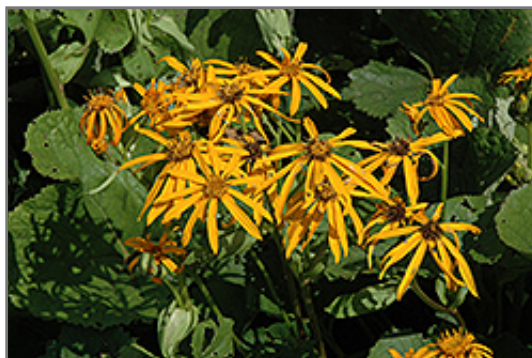
Othello Rayflower flowers

Othello Rayflower will grow to be about 30 inches tall at maturity extending to 4 feet tall with the flowers, with a spread of 30 inches. It grows at a medium rate, and under ideal conditions can be expected to live for approximately 20 years. As an herbaceous perennial, this plant will usually die back to the crown each winter, and will regrow from the base each spring. Be careful not to disturb the crown in late winter when it may not be readily seen!