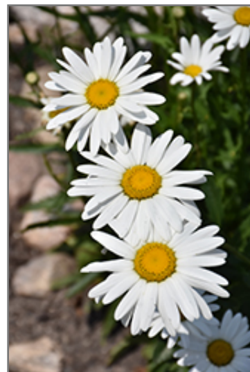
Silver Princess Shasta Daisy flowers