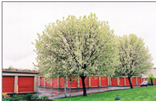
Bradford Ornamental Pear in bloom

Bradford Ornamental Pear is recommended for the following landscape applications;