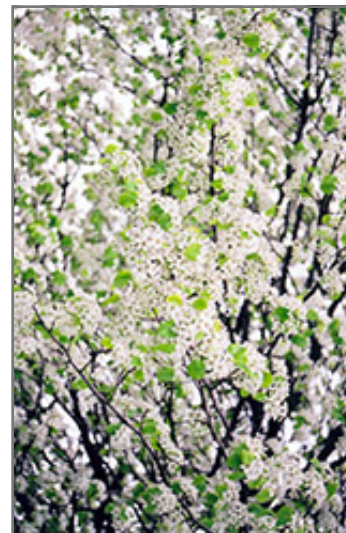
Bradford Ornamental Pear flowers