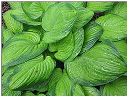
Guacamole Hosta foliage

Guacamole Hosta is recommended for the following landscape applications;