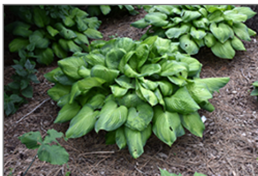
Guacamole Hosta